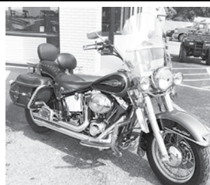
2005 Harley Davidson Softail $4,999

TOP PRICES PAID FOR: BROKEN OR UNWANTED GOLD. Cash paid on the spot. STATEWIDE PAWN SHOP