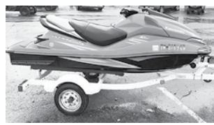
2008 Kawasaki Ultra 250X $4,999

MOTONATION 16170 Hwy 18 S Bolivar, TN 731-658-5898