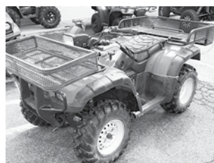
2001 Honda Rubicon 4x4 $2,499