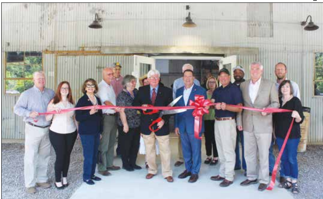
Photo: The Lafayette Gin in Grand Junction had its grand opening in May.

HAVE YOU SEEN? Our News • Our Sports • Our Music Browse www.wmodradio.com and click on County Journal Television