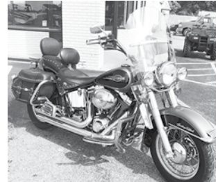
2005 Harley Davidson Softail $4,999

221 South Main, Suite 2 Bolivar, TN 38008 Bus. 731-658-7114 Fax 877-222-67653 TF. 877-658-7114 brent.stone@edwardjones.com www.edwardjones.com