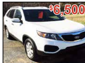
2013 KIA SORENTO Miles: 180,734 • Stk#9095