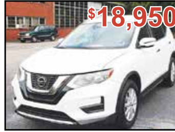
2019 NISSAN ROGUE SV Miles: 27,446 • Stk#1525