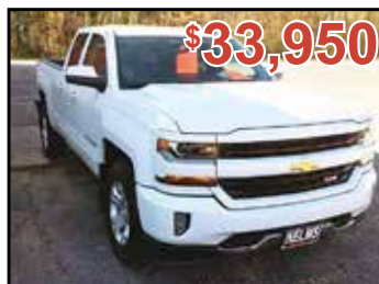
2017 CHEVROLET DBL 4X4 Miles: 32,597 • Stk#9928