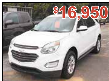
2017 CHEVROLET EQUINOX Miles: 25,576 • Stk#9093