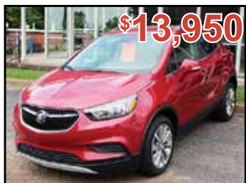
2017 BUICK ENCORE Miles: 48,688 • Stk#5050