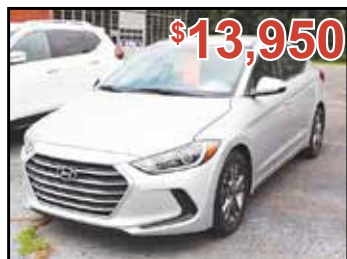
2017 HYUNDAI ELANTRA SE Miles: 20,229 • Stk#0513