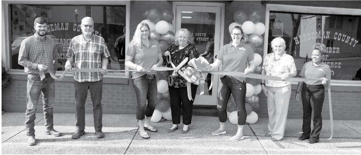
The Hardeman County Chamber of Commerce hosted a Community Day on November 20, with an open house, lunch, and drawings for door prizes.