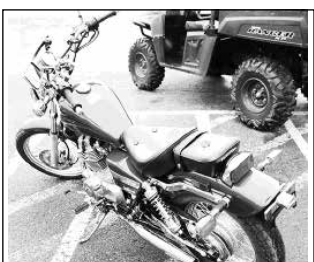
2015 Honda Rebel $2,399

JOES CYCLE SHOP A DIVISION OF MOTION 16170 Hwy 18 S Bolivar, TN 731-658-5898