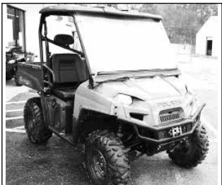
2010 Polaris Ranger 800 $3,999

TO PLACE AN ORDER CALL 1-800-643-8439 www.fishwagon.com