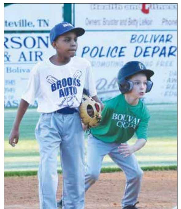
Photo: Bolivar Credit defeated Brooks Auto 9-4 at the Lions Club in the opening game of the 10U season.

WMOD Radio in Bolivar will begin broadcasting regular season games in May, with each team in the league being on the air at least one time.