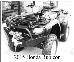
2015 Honda Rubicon $4,399